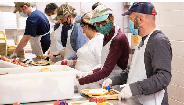
Nashville Rescue Mission