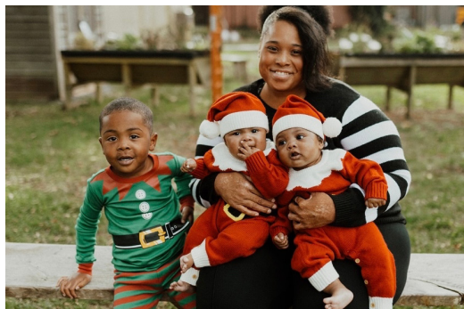
Martha O'Bryan Center

Montgomery Bell Academy Monthaven Arts and Cultural Center Music for Seniors Musicians On Call NASBA Center for the Public Trust Nashville Children's Theatre Nashville Civic Design Center Nashville Coaching Coalition Nashville Conflict Resolution Center Nashville Dolphins Nashville Food Project Nashville International Center for Empowerment Nashville Launch Pad Nashville Opera Nashville Public Education Foundation Nashville Public Library Foundation Nashville Public Radio Nashville Public Television Nashville Repertory Theatre Nashville Rescue Mission Nashville Symphony Nashville Youth for Christ Nashville Zoo National Museum of African American Music Native American Indian Association of Tennessee