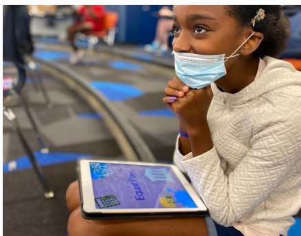
Boys & Girls Clubs of Middle TN