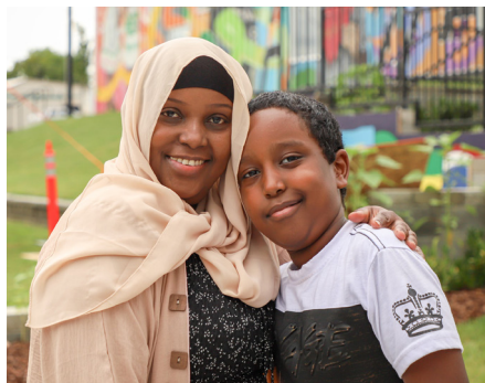
Tennessee Immigrant and Refugee Rights Coalition