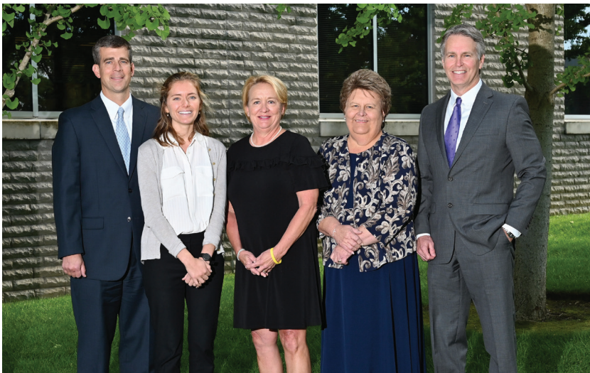
THE MEMORIAL FOUNDATION STAFF (left to right)