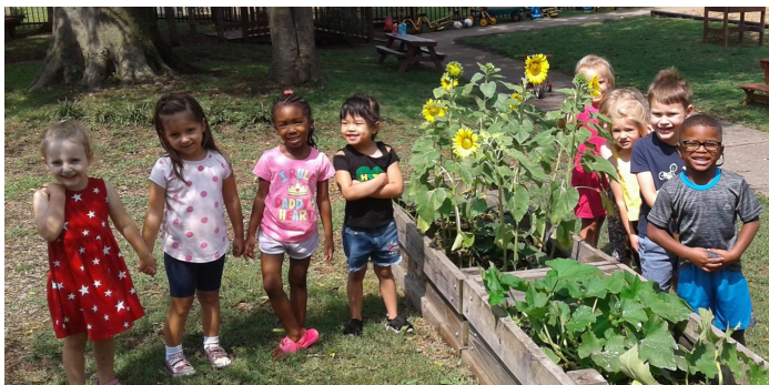
St. Luke's Community House