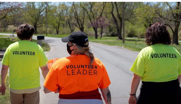
Hands on Nashville