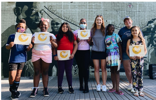
Preston Taylor Ministries