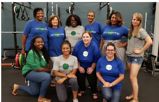
New Beginnings Center